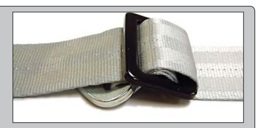
Standard 3-Bar Slide (LV10 shown with B24). Can substitute B14, B64 or a Bar.